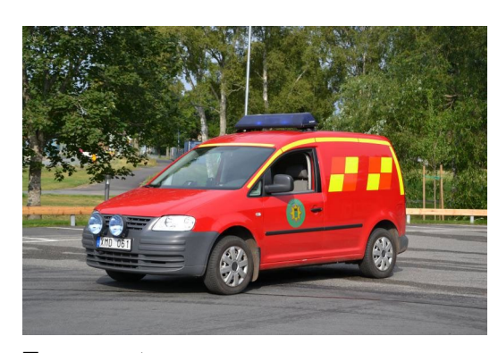
Transport van Model: VW Caddy Model year: 2006

Equipment: Fire extinguisher, first aid kid