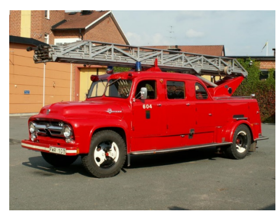
26 614 Ladder vehicle