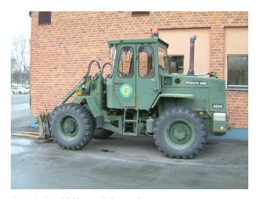
26 616 Wheel loader